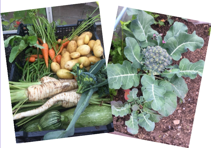
Above clockwise: No Dig demo bed in July; Baby broccoli; Veg harvest in August.

Now we need to start to plan for the future. We hope to maintain contact with our course tutor, Cherry Taylor, and fellow course participants, so that we can continue to grow and learn together. In the autumn we will put together a new seed list of vegetables to grow next season. If indoor activities continue to be permitted under COVID restrictions, we will also think about providing an introductory session on No Dig gardening to raise awareness and give advice for those wanting to try out this approach for the first time. Please get in touch if you would be interested in taking up this idea and what you would like to see covered. Our contact details can be found on the back page.