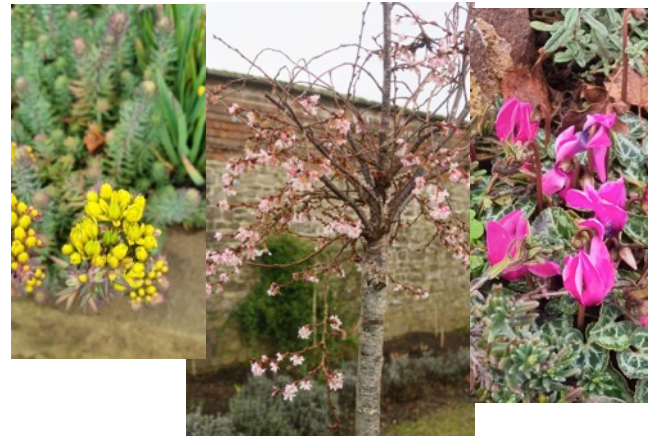
Above: Dahlia bed replanting and various plants still flowering in the garden.