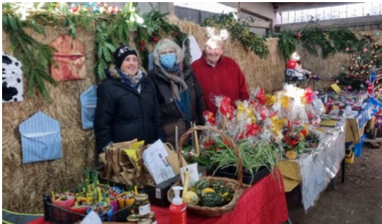
Volunteers ran a craft stall and wreath making class at the Billy Bob Christmas Craft Fayre in Llangibby.

The Walled Garden was a hive of industry in the run up to Christmas as volunteers got crafting to generate funds from pop up craft stalls and wreath-making workshops.