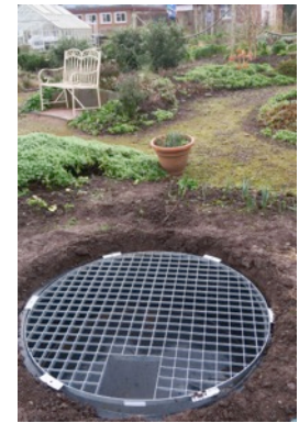
Above: Stone stack pre-installation and the water tank and pump being positioned.